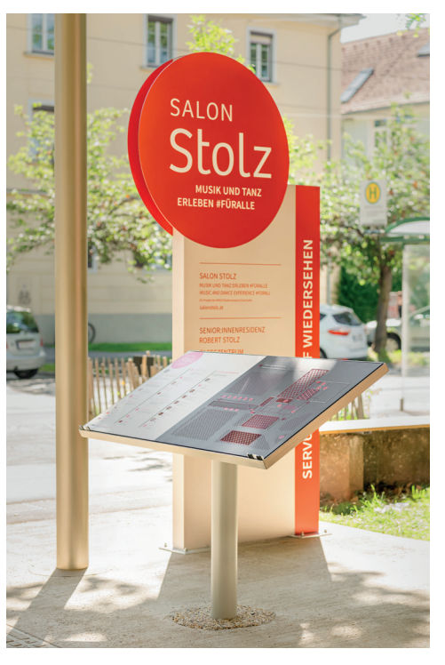
Tactile orientation map